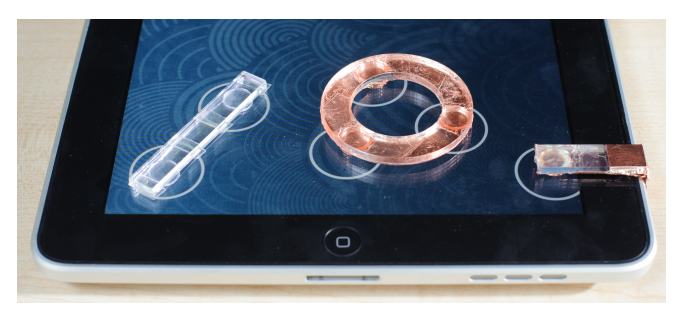
Figure 1. PUC widgets on an iPad: a transparent Bridge PUC (left) and a Ring PUC (center). The clip to permanently ground a touch point and override the iPad's adaptive filter can be seen on the right.

UIST'13 Adjunct, October 8-11, 2013, St. Andrews, United Kingdom. ACM 978-1-4503-2406-9/13/10. http://dx.doi.org/10.1145/2508468.2514926