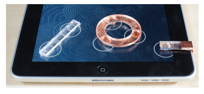
Figure 1: PUC widgets on an iPad: a transparent Bridge PUC (left) and a Ring PUC (center). The clip to permanently ground a touch point and override the iPad's adaptive filter can be seen on the right.

http://dx.doi.org/10.1145/2512349.2514595