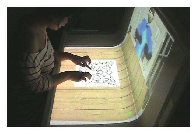
Fig. 3. A participant during the second study with a nearly complete puzzle and her remote collaborator in front of her

We recorded each session at both displays in order to analyze the participants' behavior and interaction with the display. We counted the spatial descriptions of different puzzle tile positions during a session (left/right, front/back) and its according spatial reference system. We also counted pointing, description of the tile content and tile movement for each participant. Each description was also categorized into one of three categories: successful (e.g., participant received a tile after asking for it and describing its position), not-successful (e.g., collaborator moved the wrong tile), and descriptive (e.g., "I will drag this tile over here."). The participants answered an online questionnaire based on 5 point Likert scales after solving the puzzle.