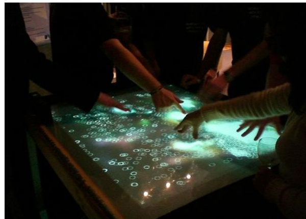
Figure 1: Multi-touch sensitive surfaces are particularly useful for collaboration on large displays such as multi-user tabletops.

Vision-based systems have been proposed to provide higher resolution and support for malleable surface materials. These systems either approximate the 3D position of the user's hand through pixel intensity [6], stereoscopy [5][13], or through markers attached to a deformable material [3][10][11]. Using a deformable material has the added advantage of providing passive