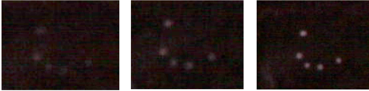
Figure 2: The pixel intensity grows as touch pressure grows. The left image is a zero-force touch, center is a light press, and right is a hard press.

haptic feedback and adds an element of depth to the interaction surface. Additionally, these surfaces typically report pressure as a vector, meaning touch pressure can be interpreted in directions not necessarily perpendicular to the interaction surface. However the markers on the deformable material must be opaque, meaning the system must be top-projected.