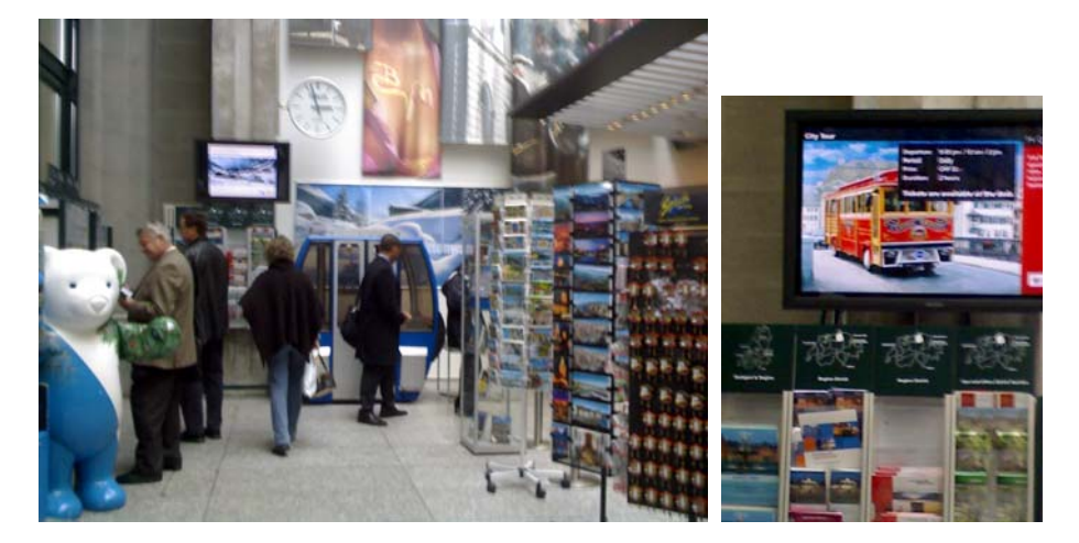
Fig. 1. Travel Agency A, a busy enclosed space featuring a large display advertising travel specials and paper travel brochures