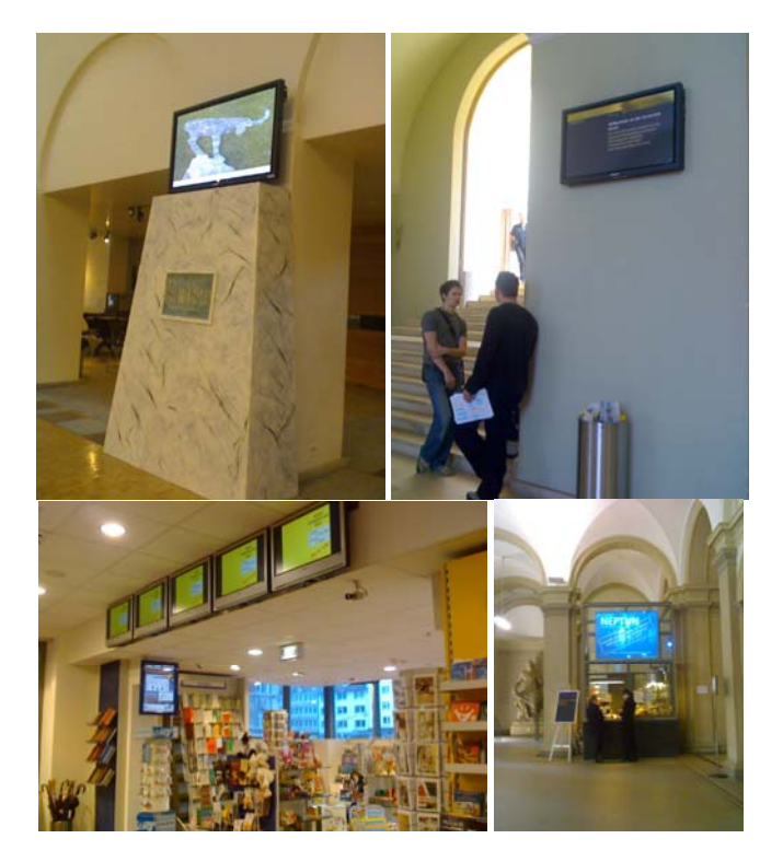
Fig. 3. Large displays in positioned well above passersby's heads in a variety of location attract few glances