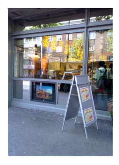
Fig. 4. A display located significantly below eye-level unsurprisingly receives almost no glances and is often obscured from sight by passersby