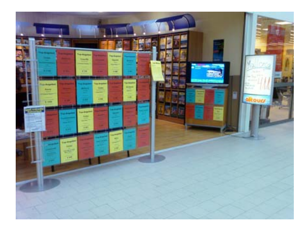
Fig. 2. Travel Agency B, an open space off of a well-trafficked grocery story entranceway, featuring colorful photocopied flyers and a large display advertising travel specials

After hour-long observations at both sites, we found that although the displays were similar in content, domain, and intent, there were several marked differences. Because of the nature of the spaces in which they were located, the goals of people n the spaces differed. The people in the viewing area of Travel Agency A were there because they were intentionally seeking travel information; they had made a conscious decision to enter the office and the display was therefore reaching a somewhat targeted audience. In comparison, the display in Travel Agency B was broadcasting information to coincidental passersby- the grocery store customers who were walking by the travel agency on their way out of the store. In both locations, we found that people's glances at the large display were rare and lasted approximately 1-2 seconds. Glances at Travel Agency B were relatively more frequent, with 17 out of 105 people