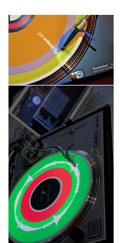
Figure 1: DiskPlay visualizes additional information directly on the timecode record of a digital vinyl system, integrating visual output and tangible controller in on device.