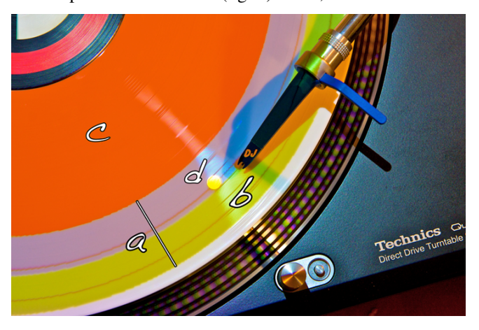
Figure 4. DiskPlay displaying a track. (a) Remaining playback area (blue). (b) Part already played as progress indicator (green). (c) Unused timecode part (red). (d) Cue points (yellow dots).

The focus of DiskPlay is to enhance the DVS setup such that the information available on a classic vinyl becomes visible again. Current DVS implementations separate visualization (on the computer) and control (on the turntable). Most vinyl emulation software implements some kind of visual notification alert to inform of the upcoming end of a track, e.g., by some flashing UI element (fig. 3). Nevertheless, this requires the DJ to repeatedly glimpse at the computer display while he is mainly working with the turntable. DiskPlay integrates visualization and control by augmenting the timecode record with important information (fig. 4). First, we visualize track