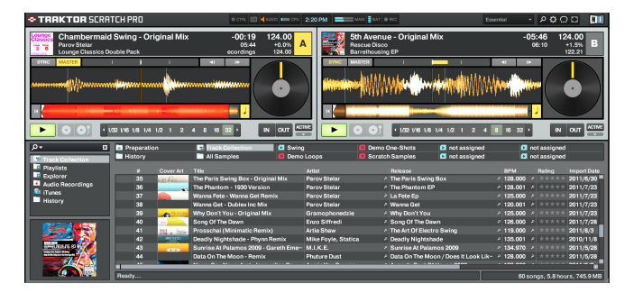
Figure 3. Traktor Scratch Pro user interface. The left track is close to the end, indicated by the waveform overview flashing red.

The Attigo TT<sup>4</sup> is a touch-screen based visual turntable, designed to easily work with digital audio content. It allows DJs to directly work on the waveform, resulting in fine-grained control. But as with the multi-touch enabled DJ environment presented in [9], they introduce new interaction techniques, and the lack of haptic feedback prevents DJs from calling on their familiar and perfected techniques.