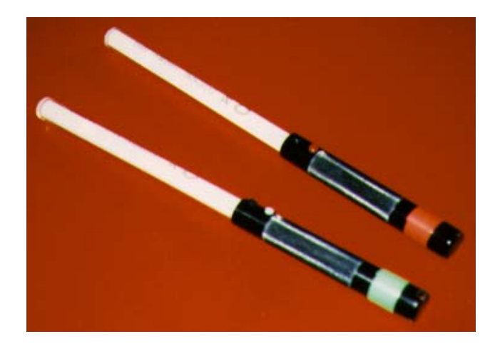
Figure 1. The infrared batons used in the WorldBeat exhibit.

On the user interface side, we met the requirements by using two infrared batons (see Figure 1) that deliver 2-D position information with an additional action button for special functions. They are used for all interaction with the exhibit, making the interface very consistent.