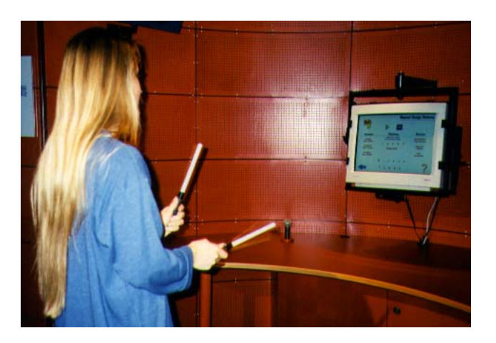
Figure 2. A visitor using the WorldBeat exhibit in the Ars Electronica Center.

• The user, standing in front of the exhibit (see Figure 2), holds the batons in her hands and points them at the monitor. She presses the baton action buttons to select links while navigating, or to trigger a special musical function while playing. The current interaction metaphor and meanings of button presses etc. are always explained on-screen.