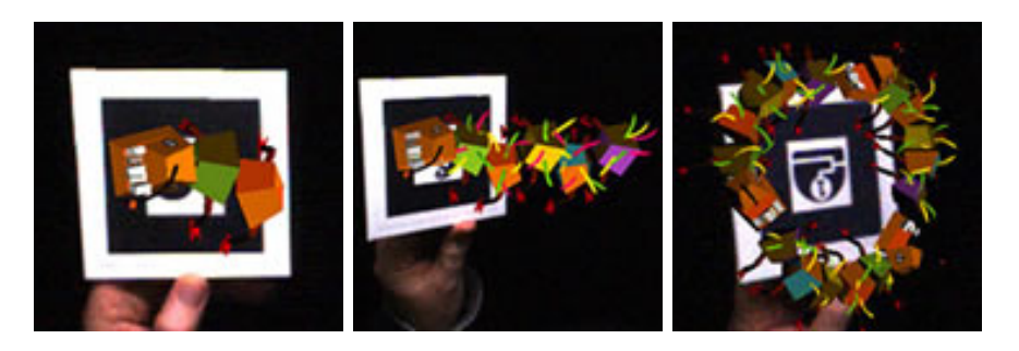
Fig. 4.1: Creatures evolving from Music Table cards

The degree of flexibility which a VR/AR environment offers, opens up countless ways of implementing user interface design. We will now look at the particular UI metaphors used by the VR/AR instruments.