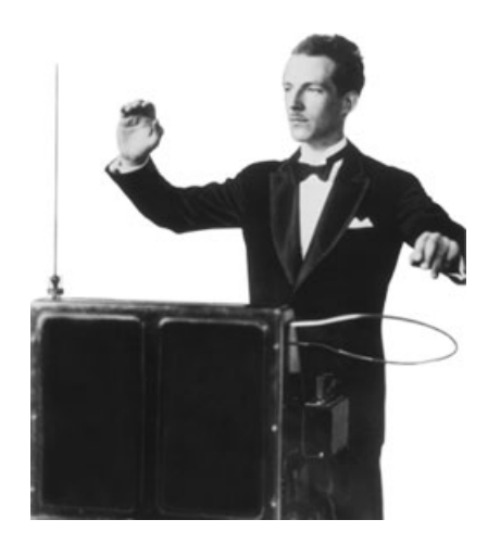
Fig. 1.1: Léon Theremin

Music is considered a universal language that all humans share. It can be regarded as a historical document of every human culture and human history itself. During the medieval times, music mainly consisted of vocals and very simplistic instruments. With the rise of the renaissance, new instruments were invented and the baroque era gave birth to opera and the orchestra. The classical age was the time of famous composers such as Mozart, Beethoven and Haydn who developed new forms of musical composition like homophonic playing styles that consisted of a single melodic line supported by chords. When the romantic era began, the musical restrictions of the past eras were broken and experimentations and thus artictic creativity became dominant. Finally, since the beginning of the 20th century, music has achieved a broad spectrum of styles which do not fit into the old categories and laws anymore. Experimentation is what defines music nowadays and with the technologies that evolve from day to day, there are endless possibilities yet to discover. Electronically generated sounds are the most famous invention of this era and new electronic interfaces have been invented for music production. One of the first