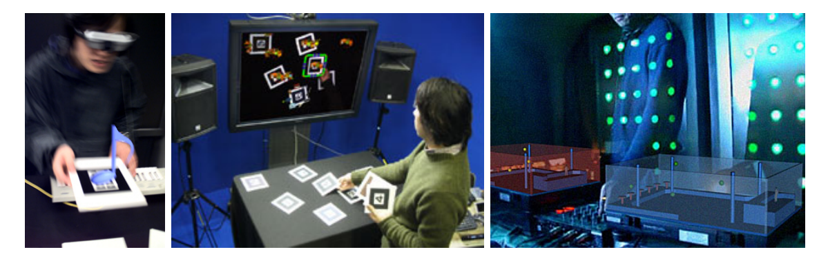
Fig. 3.3: The Augmented Groove, AR Music Table and AR-DJ

the real environment where any changes can be made in real-time, the other being an exact simulation of the real world but with a different sound set for prelistening and mixing. This feature is useful for collaborative sound production with one user arranging sound sources on the dance floor in real-time and the other premixing sounds at the same time.