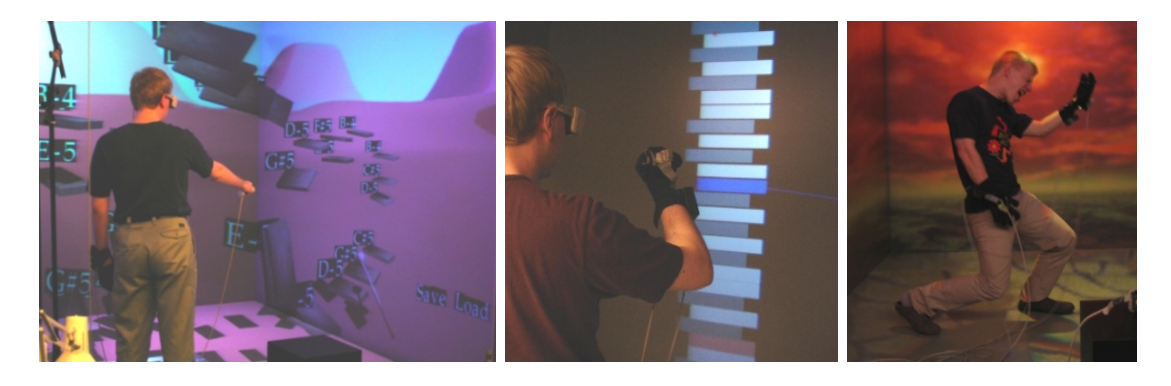
Fig. 3.2: The Virtual Xylophone, the Virtual FM Synthesizer and the Virtual Air Guitar

happens on three levels. Gestures are detected by an input module which sends out the data further on to a gesture recognition module for the identification of guitar playing gestures. These gestures can either effect the sound model directly or be sent to a phrase database first to produce musical phrases. The phrase database saves data on the gestures being made and the order and the time for sending them on to the sound model controller. The sound model controller then converts the data that the sound model can interpret. It is able to identify basic guitar playing techniques such as hammer-ons, pull-offs, sliding, vibrato and mute. The interface provides play modes such as free play or rock solos with built-in scale quantization which makes sure that only harmonious chords are produced and thus uses predetermined sound scales.