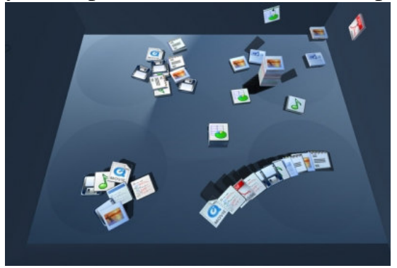
Figure 7 – BumpTop desktop

surface and when a selection of icons is moved together springs are created in between, so that their spatial relationship is maintained. This gives a user much more expressiveness to arrange the icons with a meaning, similar to piles in office desktops. Some of the physical laws were relaxed, for example it is not possible to knock a pile over when hitting it while moving an icon.