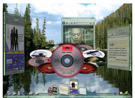
Figure 6 – Looking Glass

viewed simultaneously. The interface also offers some features like the 3D jukebox for realistic browsing of available movies. An interesting finding of "Looking Glass" is the possibility to make notes on the reverse side of the window. The designers represented a window as a physical flat object that naturally has two sides, one interactive, executing the current task, and the other one is used for notes.