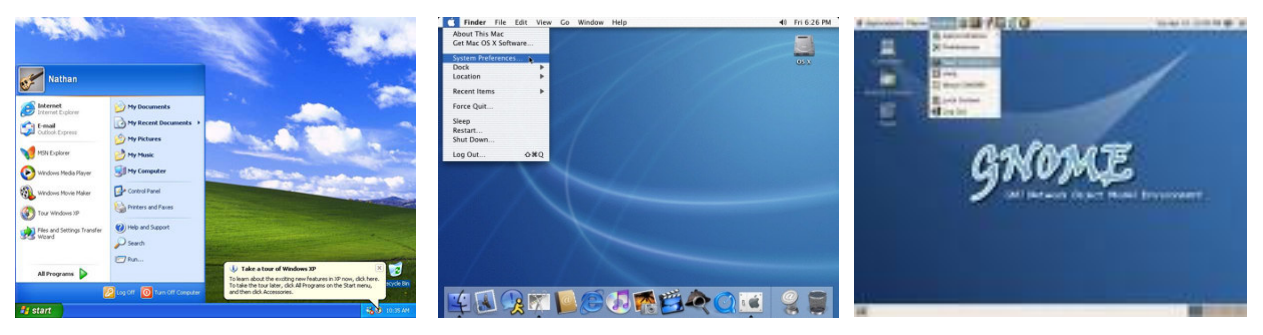
Figure 5 – Similarities in Desktop implementation in MS Windows and Mac OS

no experience with it at all, due to the cultural, ethnological, or some other differences. Second, the user, knowing well the physical base of the metaphor, can import more knowledge in its UI counterpart. As a result, the user will expect much more functionality than actually implemented. The lack of this functionality will lead to confusion and frustration of the user. Finally, the fact of wide acceptance of standard metaphors can cause the dangerous limitation of the designers' fantasy. When sticking to the discovered successful metaphor, as e.g. the flat desktop (See Fig.5), we slowly stop thinking about the possible alternatives.